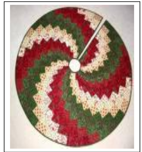
Rebecca's Christmas Tree Skirt

Looking for someplace to put your fabric scraps? They can be used to stuff pillows at the local animal shelter.